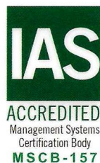
Head of Certification

This Certificate is property of DBS Certifications and remains valid subject to satisfactory surveillance audits